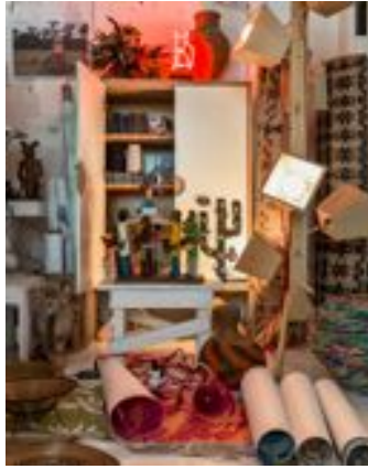
BLOOM: Luscious featuring the studio of Marcelo Rosenbaum