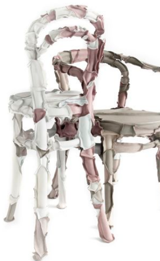
Thonet Couple, 2013 by Pepe Heykoop