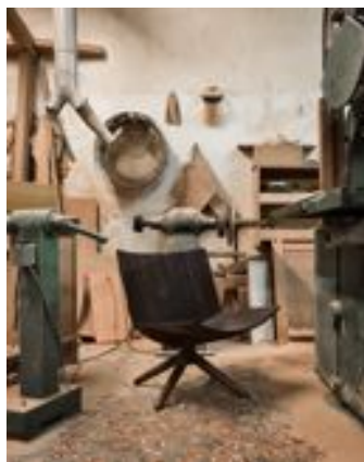
BLOOM: Luscious featuring the studio of Carlos Motta