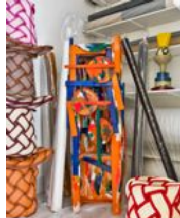
BLOOM: Luscious featuring the studio of Rodrigo Almeida