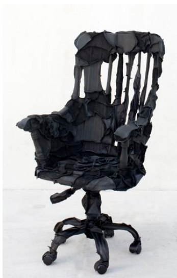
Office Chair (XXL Black), 2012 by Pepe Heykoop