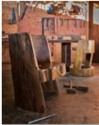
BLOOM: Luscious featuring the studio of Hugo França