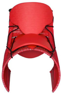
Chair Exú Asanà, 2013 by Rodrigo Almeida; The Edelkoort Design Collection, Paris

copyright-free when full credits are used: