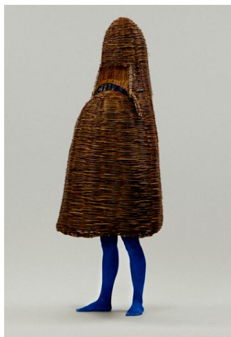
Willow Hut Creature by Femke Agema; photo © Roel Determeijer; art direction: Bas Koopmans