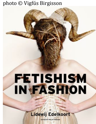
Fetishism in Fashion book cover by Lidewij Edelkoort