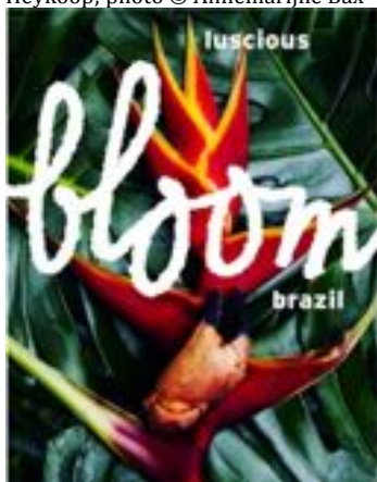
BLOOM: Luscious book cover photo © Marie Taillefer