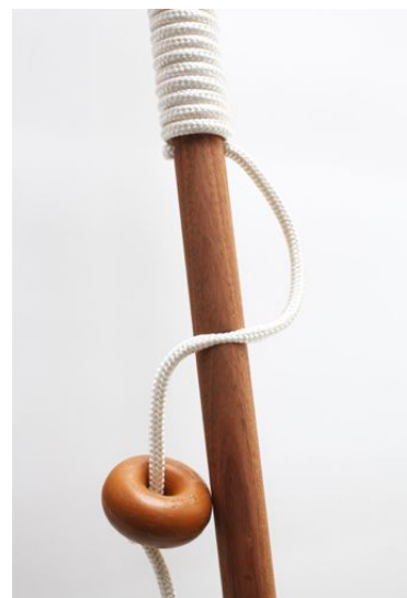
Sticks, 2012 (detail) by Brynjar Sigurdars a product of Spark Design Space; photo © Vigfús Birgisson