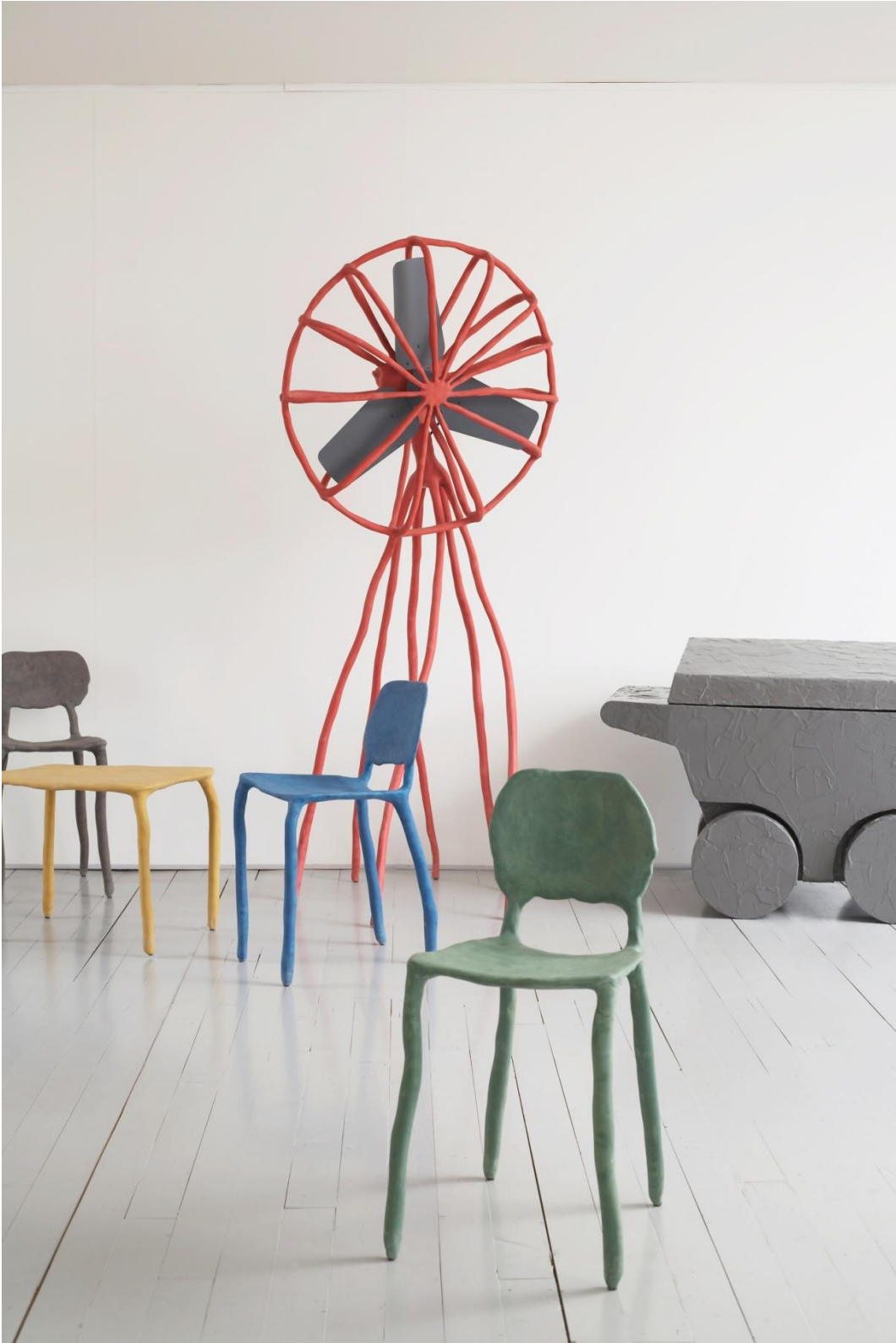
Clay (2010) by Maarten Baas, Tool Barrow (2001) by Studio Job