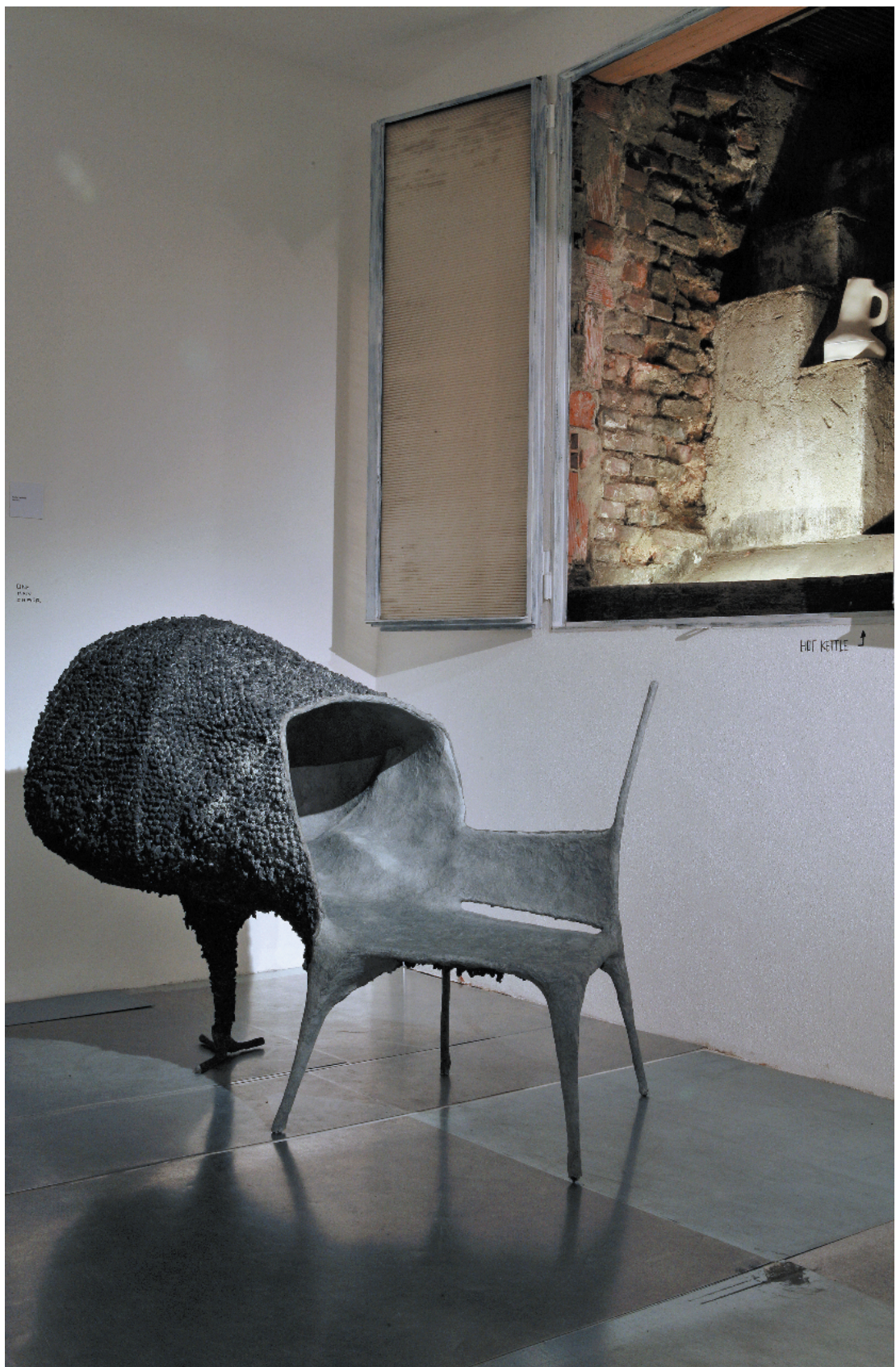
Evolution (2008) by Nacho Carbonell