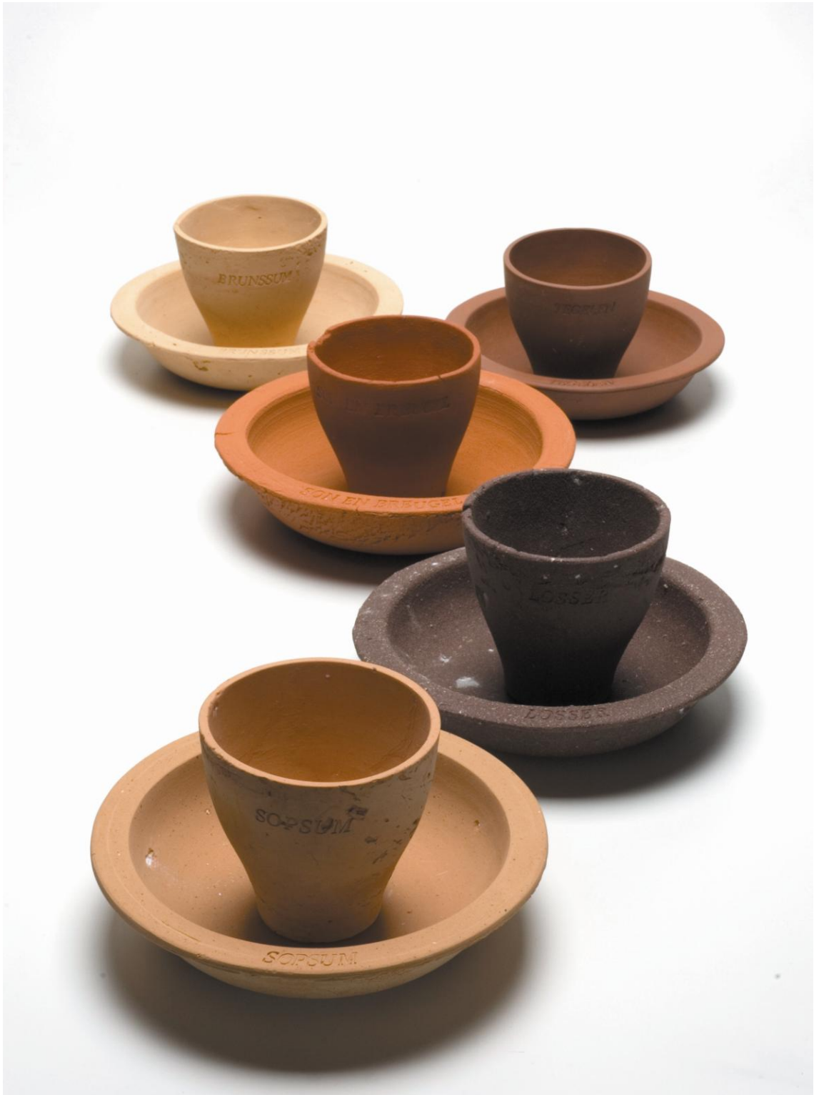
Drawn from Clay (2006) by Lonny van Ryswyck