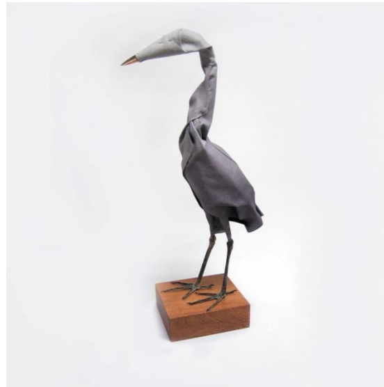
Avifauna (2010) by Maarten Kolk & Guus Kusters

A book signing will take place during the opening of the exhibition on September 10 at 20:00 , where guests may have their copy signed by Lidewij Edelkoort, along with other fashion and design publications by the author.