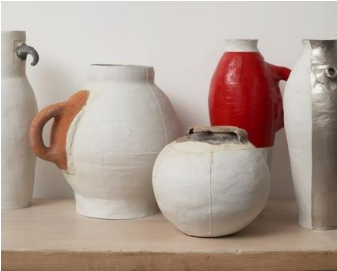
7 Pots / 3 Centuries / 2 Materials (1997) by Hella Jongerius (photography by Thomas Straub)