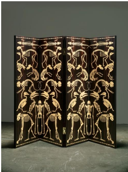
Perished Screen (2006) by Studio Job