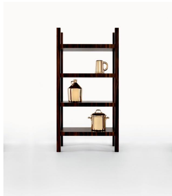
Farm (2008) by Studio Job