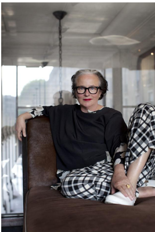
Lidewij Edelkoort

Edelkoort has collected design that has sparked important trends, as a new generation came to terms with technology within a post-millennium context, often exploring material values and craft.