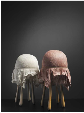
Tutu (2010) by Lenneke Langenhuijsen