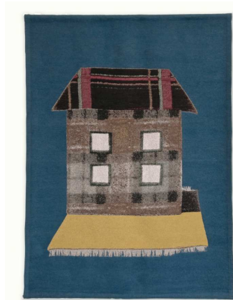
Family House (2012) by Kiki van Eijk

Trend forecaster and design curator Lidewij Edelkoort will present contemporary creative textile design in Talking Textiles at the renowned TextielMuseum in Tilburg from September 28, 2013 – January 26, 2014.