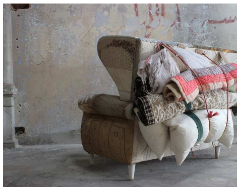
Love Boat (2013) by Bokja, from Migration series