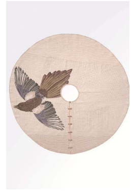
Gazza Top (2011) by Studio Formafantasma