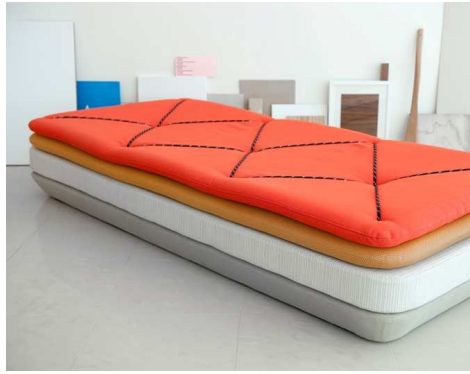
Bidoun (2009) by Katrin Greiling