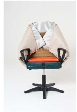
Kawakubo (2009) by Rodrigo Almeida