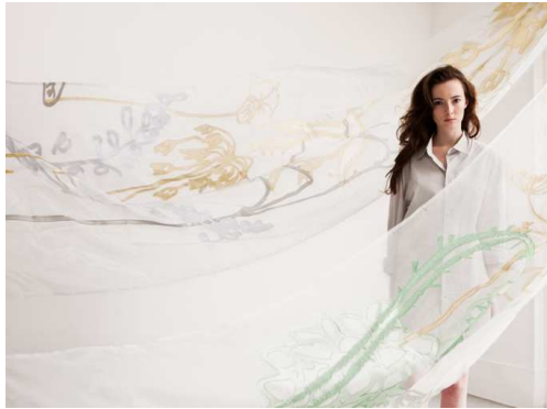
Herbs from My Garden (2010) by Kiki van Eijk