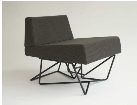
Wire (2011) by David Lynch in collaboration with Raphael Navot