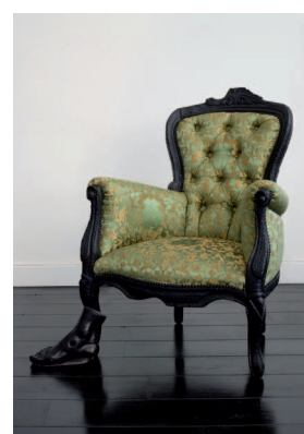
Smoke! (2011) by Maarten Baas (production: Moooi) in Les Indes Galantes jacquard by Rubelli