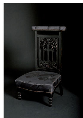
chair in Edelweiss damask by Armani/Casa Exclusive Textiles by Rubelli