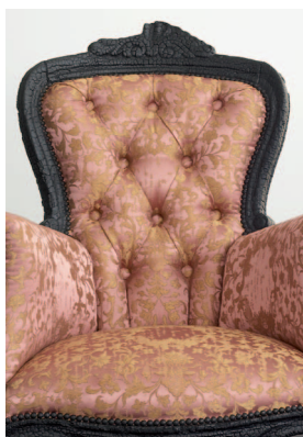
Smoke! (2011) by Maarten Baas (production: Moooi) in Les Indes Galantes jacquard by Rubelli