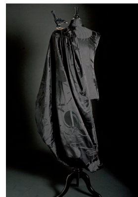
torso and drape in Bell'Insetto , damask, limited edition by Donghia