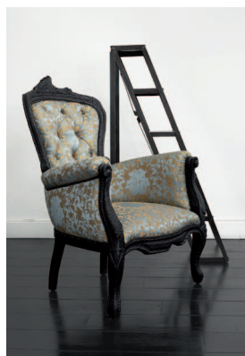
Smoke! (2011) by Maarten Baas (production: Moooi) in Les Indes Galantes jacquard by Rubelli