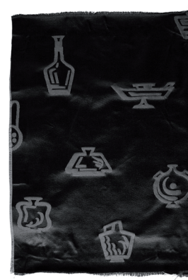
Alchimia damask by Rubelli (design by Gio Ponti)