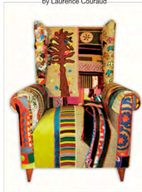
Why Not Bergere (2011) by Bokja