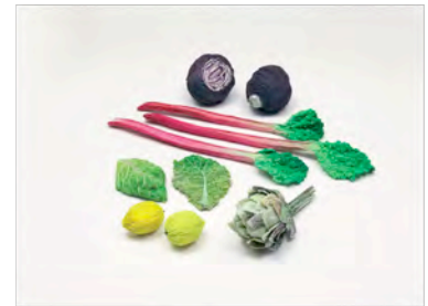
Vegetables (2009) by Scholten & Baijings