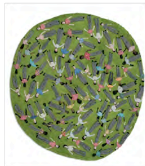
Circus Rug (2010) by Fernando & Humberto Campana