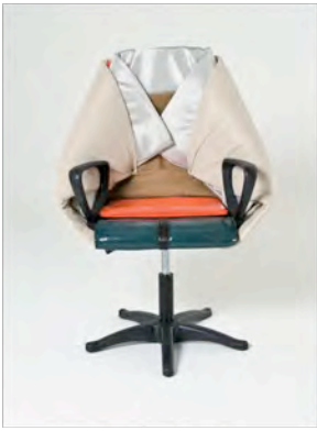
Kawakubo (2009) by Rodrigo Almeida