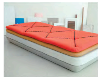
Bidoun (2009) by Katrin Greiling