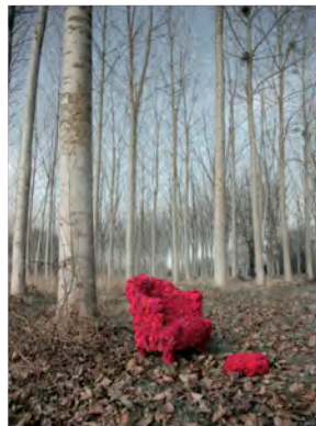
Little Red Riding Hood (2010) by Laurence Couraud