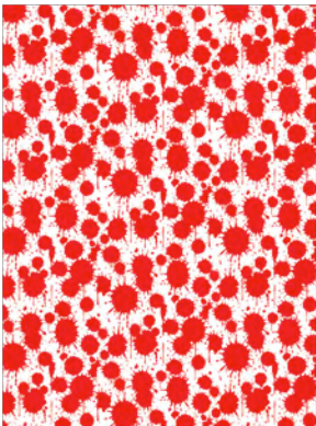
Blood (2011) by Studio Job