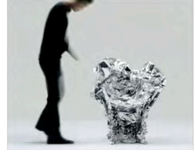
Memory (2011) by Tokujin Yoshioka