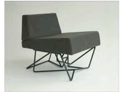
Single Wire (2010) by David Lynch and Raphael Navot