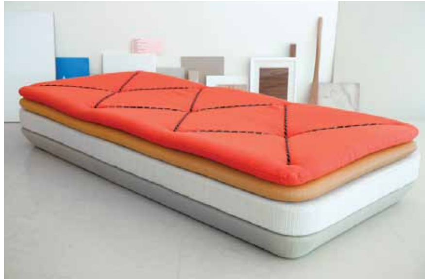
Bidoun Sofa by Katrin Greiling

“After a reaction to the increasingly digital landscape of our lives, a craving for tactility and dimension has led several designers to reconsider the role of fabrics once more” says Li Edelkoort curator of Talking Textiles. On show will be a large selection of design that uses innovative textile techniques, heralding the revival of textiles in our interiors. The exhibit is part of an initiative to discuss textiles, highlighting the importance of creativity and education at a time when the global market has put many textile mills in danger of disappearing.