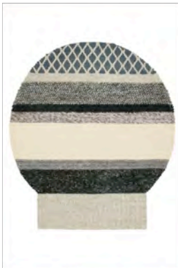
Mangas Naturele (2011) by Patricia Urquiola