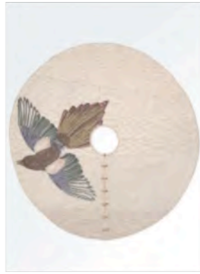
Gazza Top (2011) by Formafantasma