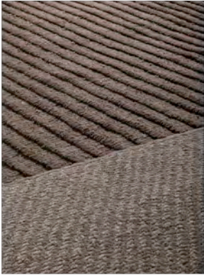
Teral 1 Rug (2011) by Bartoli Design