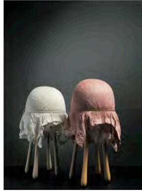
Tutu (2010) by Lenneke Langenhuisen